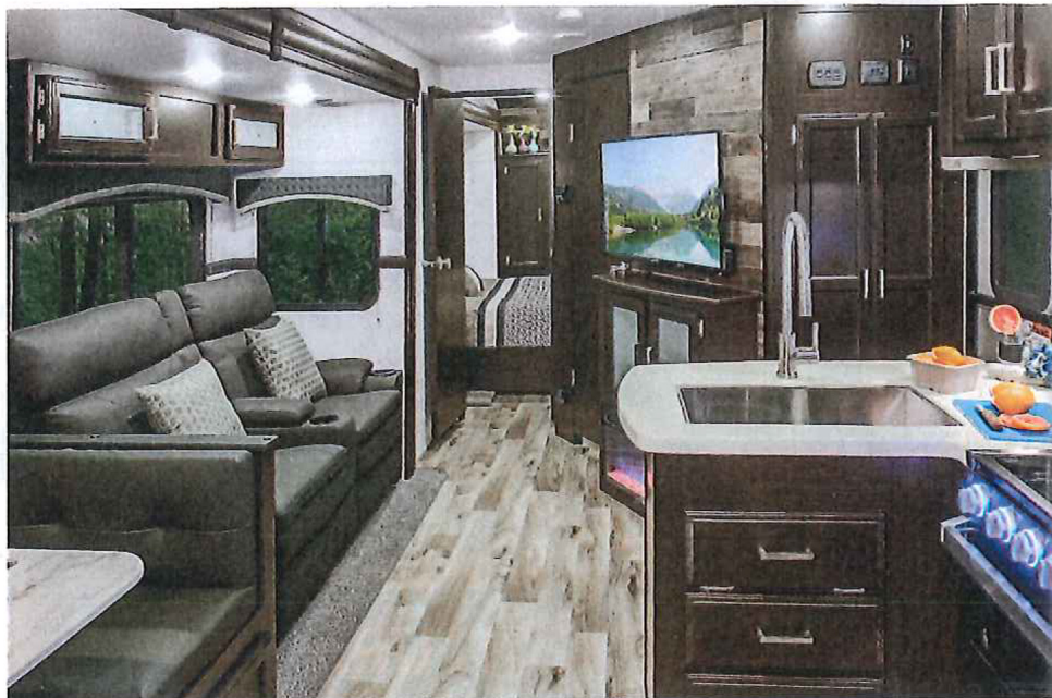
The main living area incorporates an elegant and well-equipped kitchen, a 70-inch sofa with a trifold bed, a large convertible dinette and an entertainment center. Bathrooms are located at either end.

At the opposite end of the trailer is the kids' room with its own solid entry