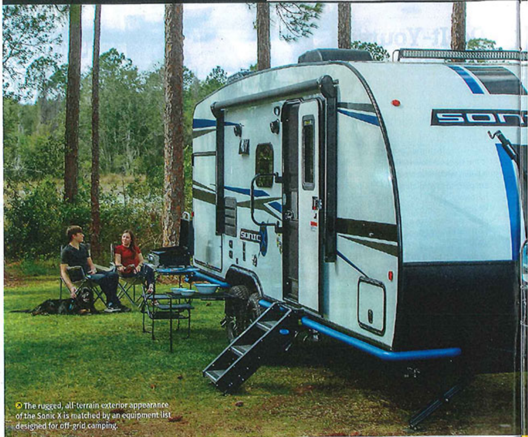
🔗 The rugged, all-terrain exterior appearance of the Sonic X is matched by an equipment list designed for off-grid camping.