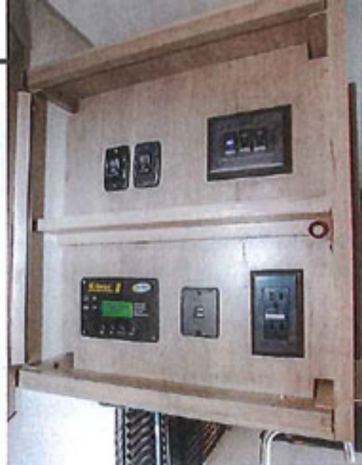
Nestled into the end of the kitchen cabinet, the control center does double duty as a hidden charging station.

Enhancing the filter system is its capability to pump water drafted from a static water source through the filter system and into the freshwater tank. Any solids are filtered out down to the micron level (or sub-micron, depending on the