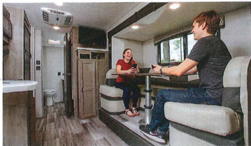
The Sonic X's dinette makes into a comfortable 48-by-88-inch bed. The table telescopes down into a track to support the bed. There's plenty of table-to-seat-back space.

The interior decor is modern-looking, with "pallet-washed-wood" grays, whites and some black accents here and there. The vinyl flooring also has a pallet-wood pattern and, overall,